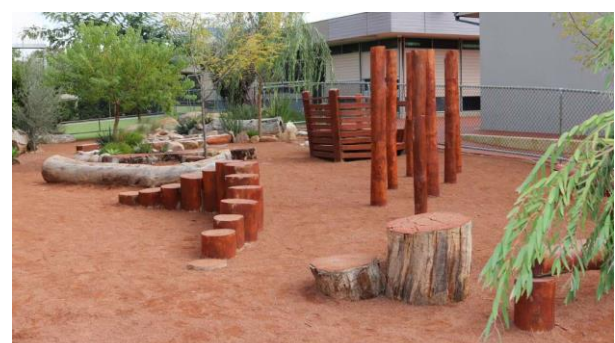
Figure 2.4: examples of a natural play area